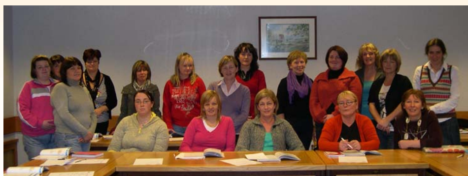
Childcare workers who achieved the CIEH Level 2 Award in Food Safety in November 2008.